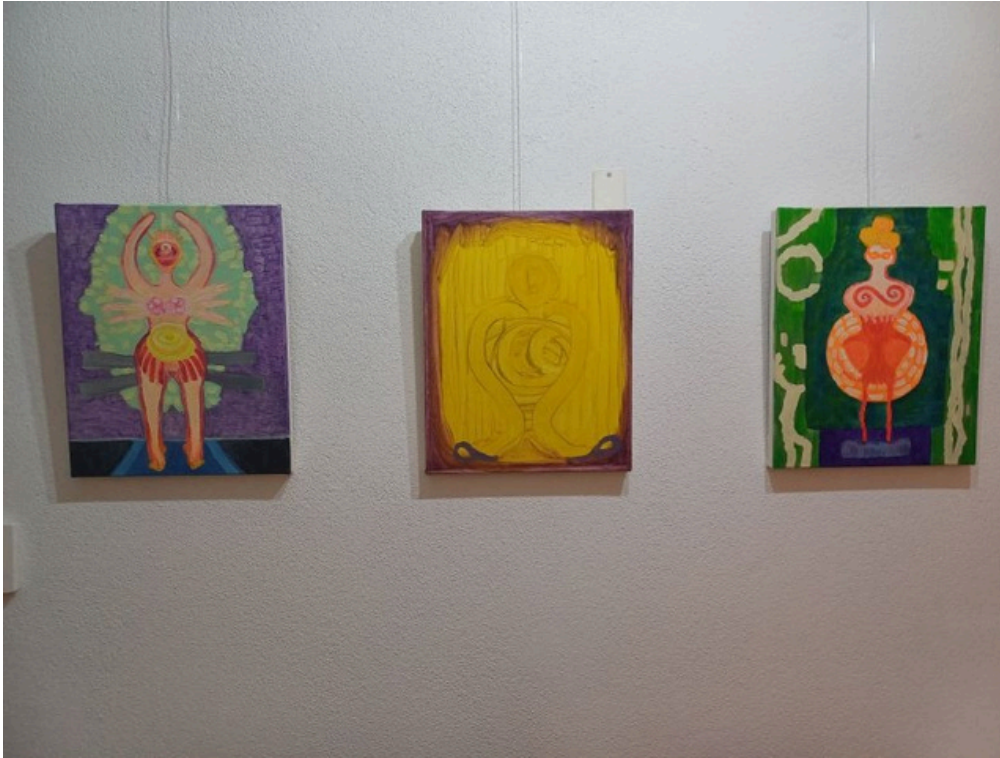
Body of work „The Embodied Revolution“.

She has drawn inspiration from the radical gestures of American women artists of the 1970s and 1980s (Mary Beth Edelson, Wangechi Mutu, Carolee Schneemann), who presented the female body and mind not only as a subject, but as an active, autonomous force. She seeks to expand and reinterpret this path through her own artistic process.