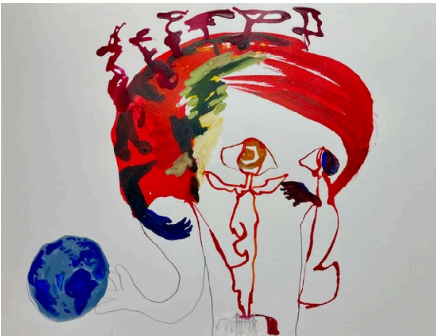
Infinite Help.

She participated in several solo and group exhibitions in Bavaria and was invited to a three-month artist residency in the New York region in 2024. Since then, she has been represented in the New York area by the Kelly-McKenna Gallery. At KULTUR im Oberbräu Holzkirchen, a permanent installation of 58 faces can be seen, following the artist's success in winning the competition held by the city council.