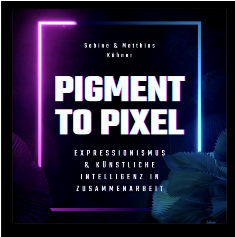
Pigment to Pixel.