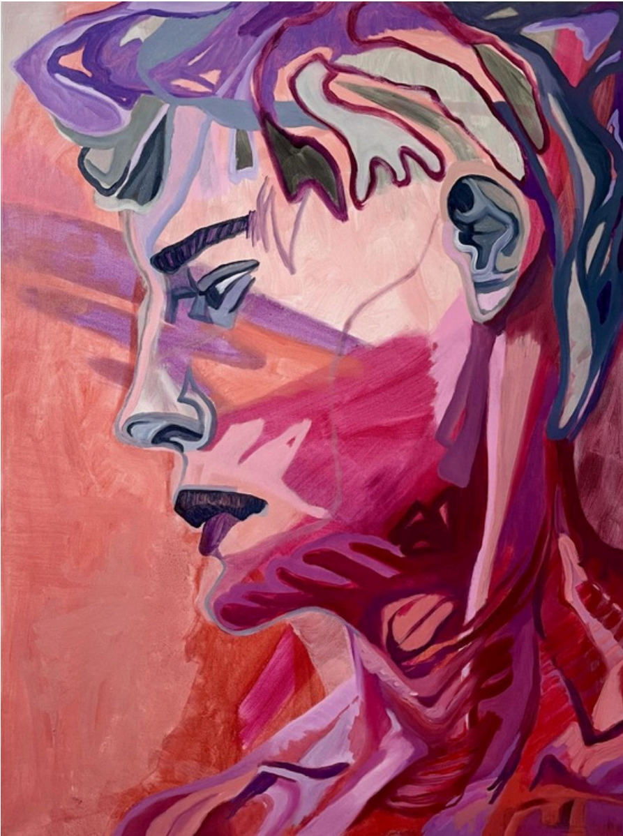
„New York Head Mana IV“.

The first project concerns the painting “New York Head Mana IV”. The video depicts the hallucinations of artificial intelligence. Accordingly the video is titled „AI hallucinations on an abstract painting”